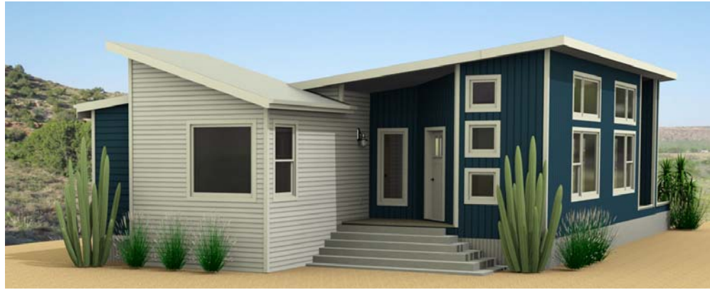
FRONT ELEVATION- A