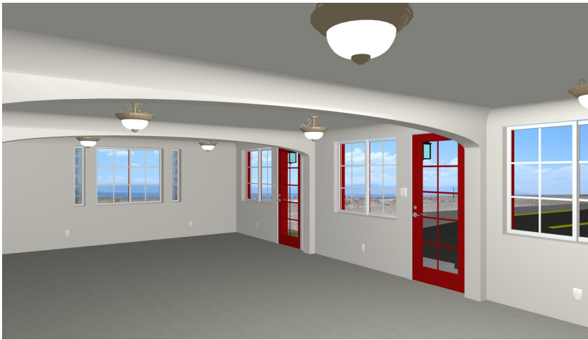
SUITE-A EXAMPLE OF TYPICAL SUITE WITH HISTORIC COVE CEILINGS AND WALLS RESTORED