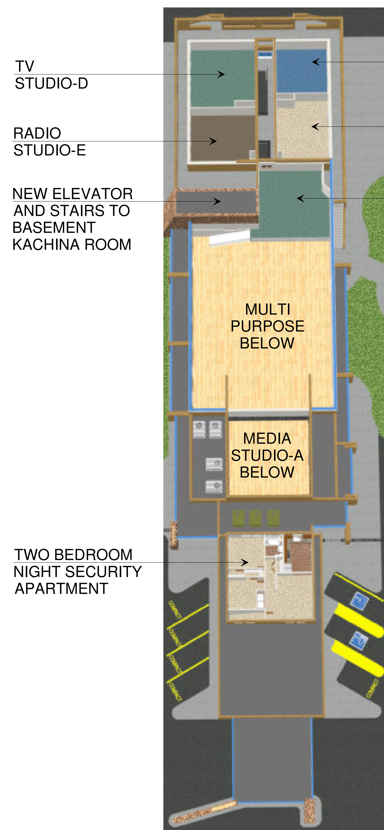
SECOND FLOOR MAIN BUILDING