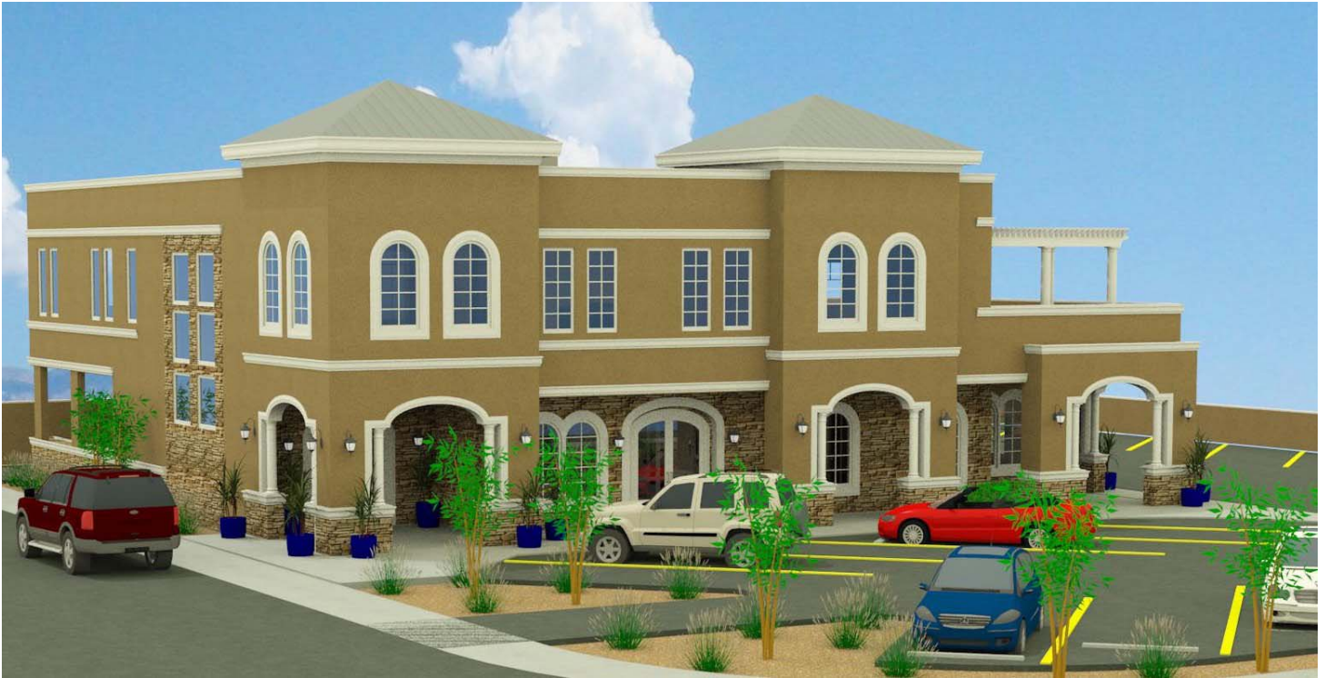
SOUTH / EAST ELEVATION