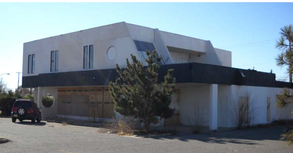
AS-IS NORTH / EAST ELEVATION