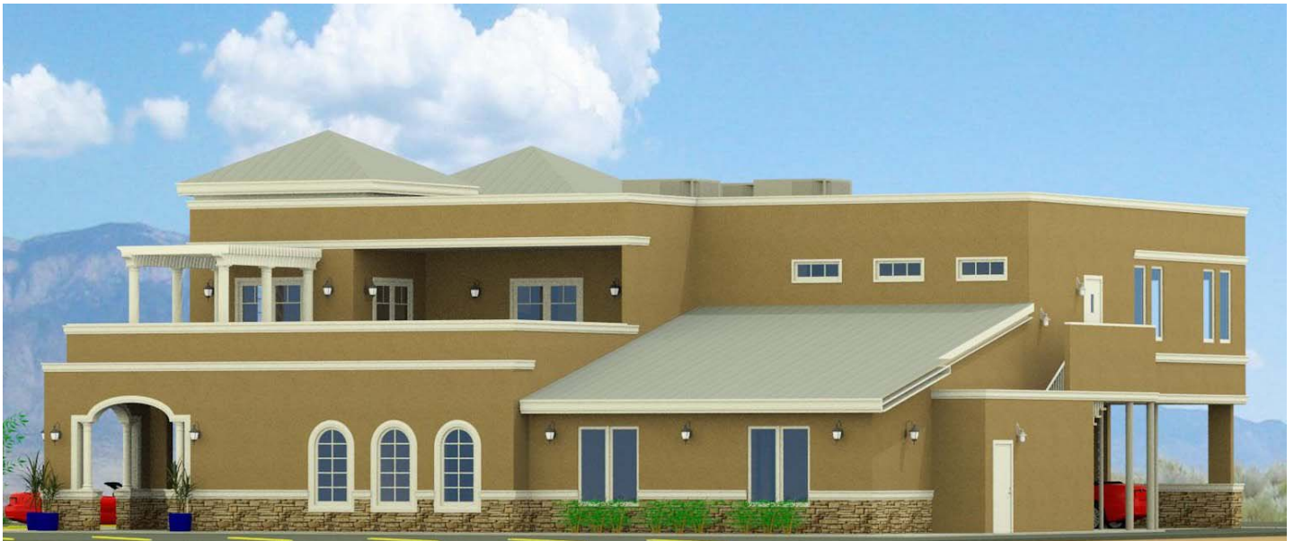
NORTH / WEST ELEVATION