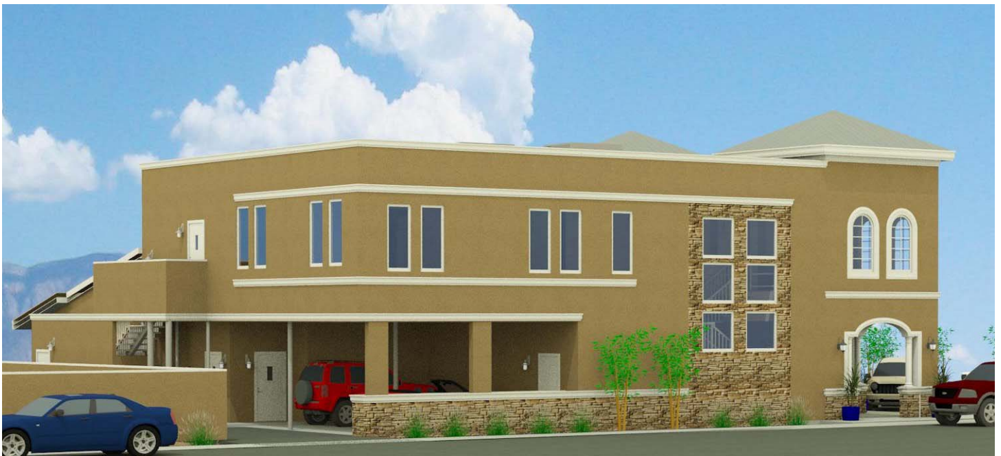
SOUTH / WEST ELEVATION