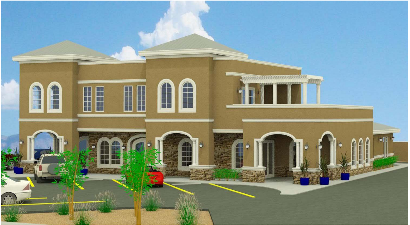
NORTH / EAST ELEVATION