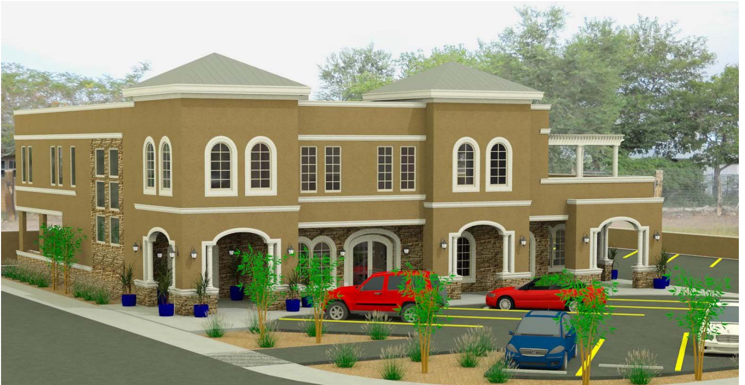
NORTH / EAST ELEVATION