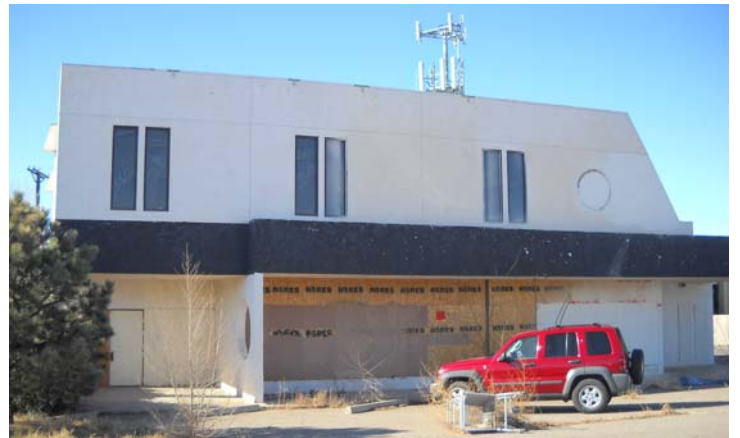
AS-IS EAST ELEVATION